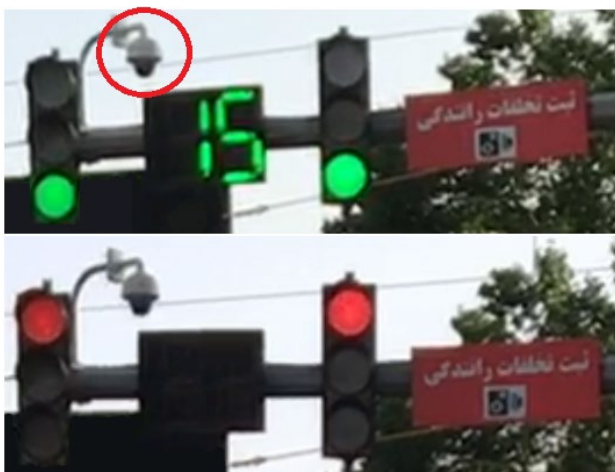
Fig. 2: Traffic control camera position and signal countdown timer operation under scenario 4